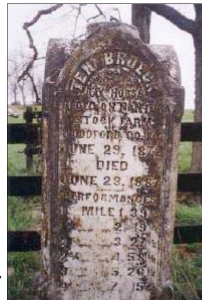
Ten Broeck's gravestone